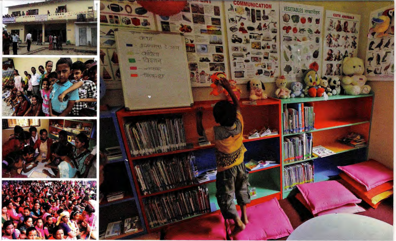
Inauguration of the Madi READ Center, Nepal