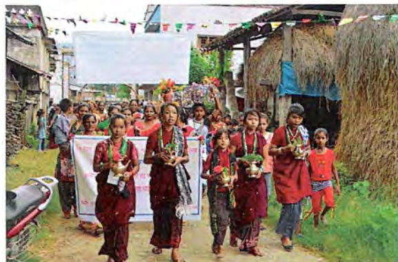
Clockwise from left: the Madi READ Center; women from Madi; the Center Management Committee; villagers celebrating the inauguration of the Center.