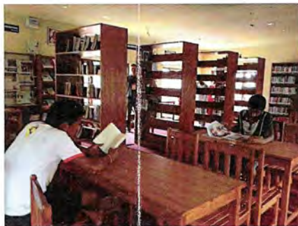
Madi villagers visiting the Center's library.